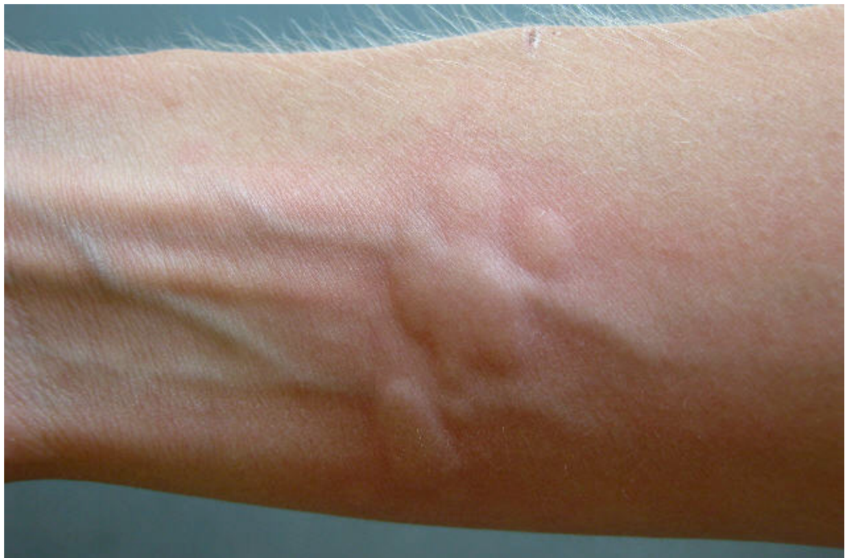
Figure 2. Wheals formed approximately 30 minutes after exposure to the urticating spines of Uraba lugens

Most cases of harmful exposure to caterpillars seem to occur in young children, and in one study of 365 cases of exposure to Lophocampa caryae Harris (Lepidoptera: Arctiidae), 80% of the records were paediatric exposures. 11 Caterpillars are a source of curiosity to children due to their easy accessibility and slow mobility, 11 and also due to these creatures' generally bright colours. Young children tend to have thinner skin and smaller bodies than adults, both of which may increase the extent of the reaction. 12